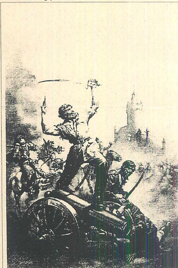
The Mad King by Boris Vallejo, 1979. Size: 16"x26".